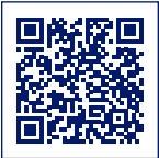
Digital Advertising Examples