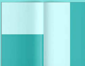
Half page ad